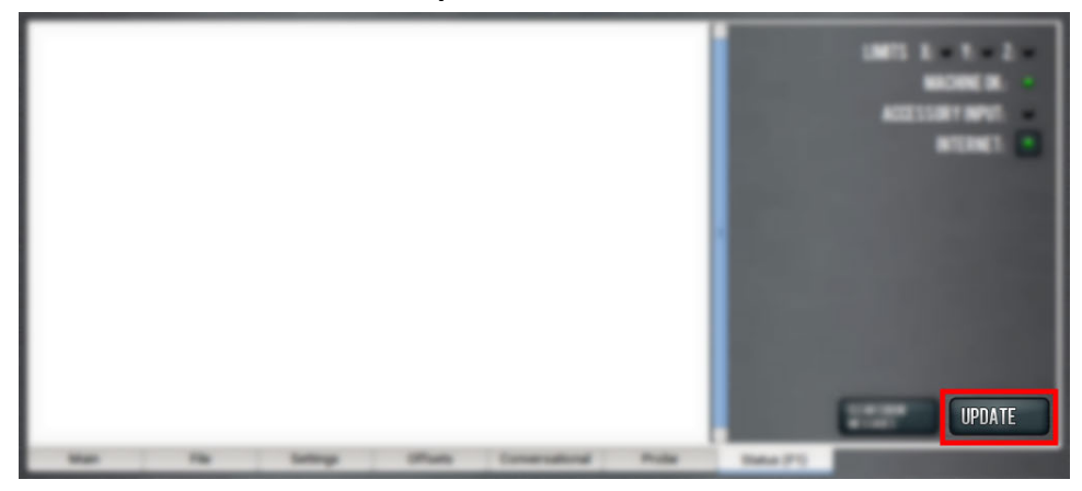
Figure 7: Update button on the Status tab.

3. From the Software Update dialog box, select Browse .