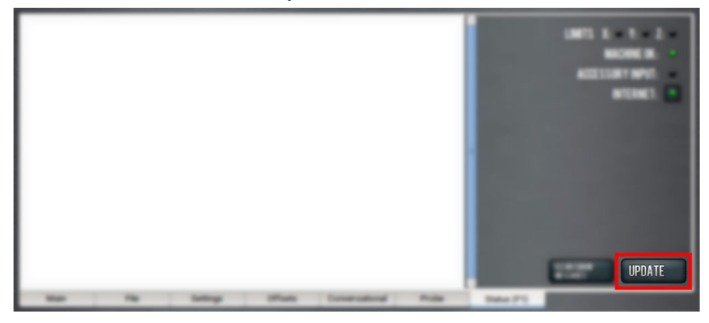
Figure 4: Update button on the Status tab.

6. From the Software Update dialog box, select Browse .