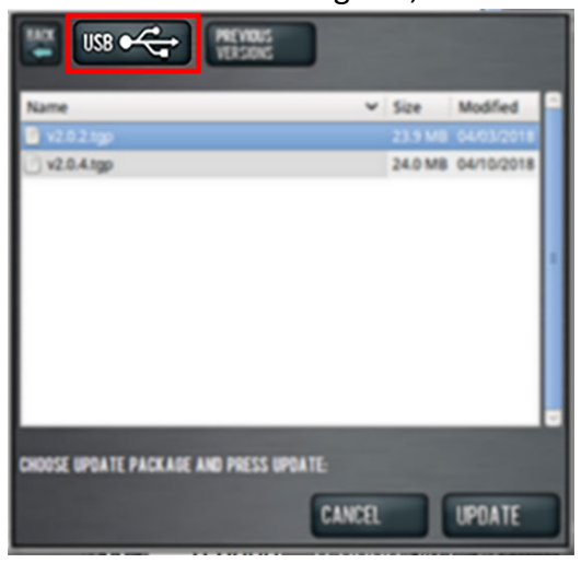
Figure 6: Browse dialog box.

7. From the Browse dialog box, select USB .