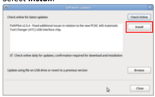
Figure 3: Install button on the Software Update dialog box.

The update file is downloaded, and a notification dialog box displays.