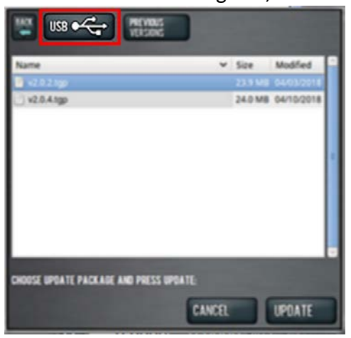
Figure 6: Browse dialog box.

7. From the Browse dialog box, select USB.