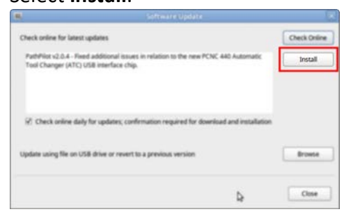
Figure 3: Install button on the Software Update dialog box.

The update file is downloaded, and a notification dialog box displays.