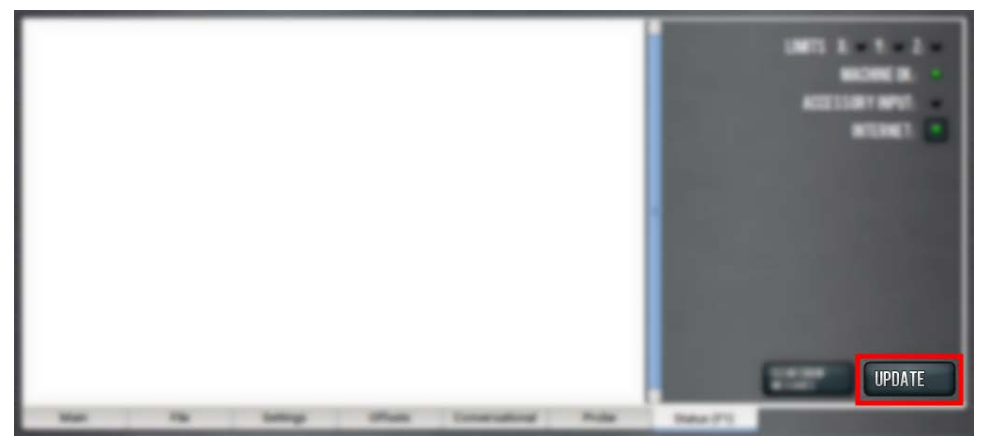
Figure 7: Update button on the Status tab.

3. From the Software Update dialog box, select Browse .