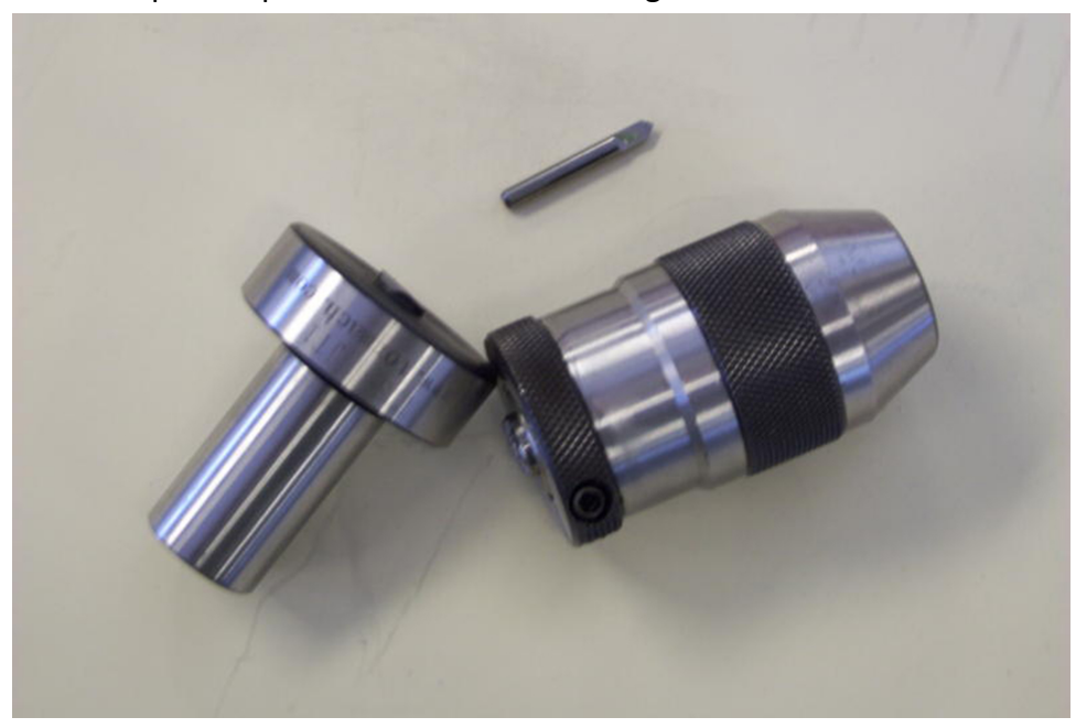
Figure 1: Jacobs taper adapter and drill chuck.

Jacob's taper adapters are used for mounting drill chucks.