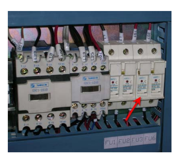
Figure 1 - Location of Fuse FU3

Remove power to the electrical cabinet and then pull down on the upper tab. The fuses are pinned, they will both open as shown in Figure 2. Remove the fuse and replace with a 0.6A fuse. The fuse is Tormach PN 30724 but Bussmann KTK-6/10, Llttlefuse KLK-.6, or Ferraz ATM-0.6