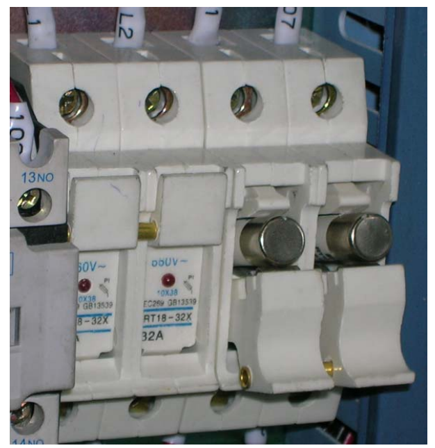
Figure 2 - Fuse block opened

are appropriate substitutes. Swivel the fuse holder back up to snap the fuse in place and restore machine power.