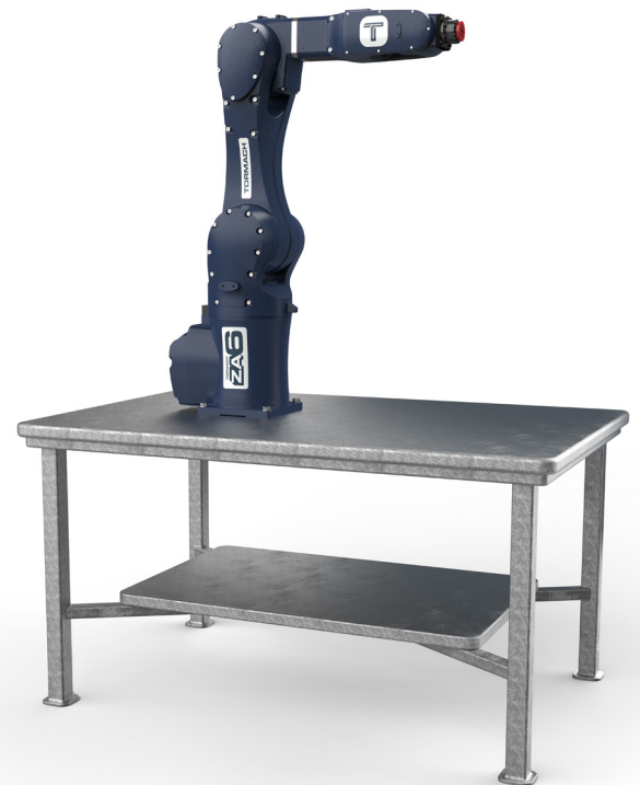
*Table not included.